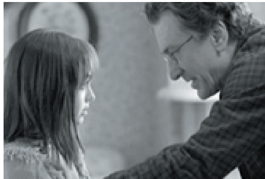
HIDE -- DeNiro and Fanning star in the thriller Hide and Seek .

Charlie does not see eye-to-eye with David, though, who he hates