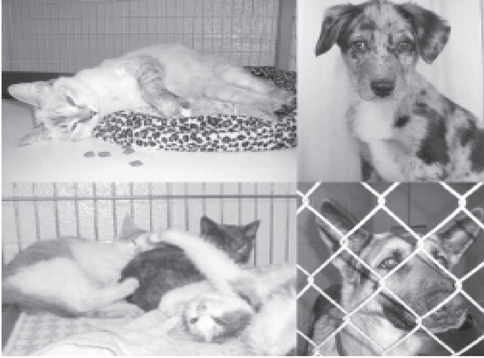
PETS WITHOUT OWNERS -- Animals at the Cookeville Animal Shelter wait for someone to adopt them.

***Warning: anyone considering giving a pet as a gift must include the recipient in this decision, as it is a personal, lifelong commitment.