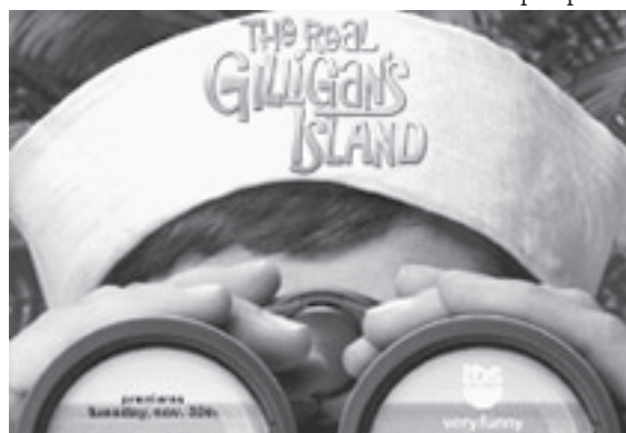
REALITY TV -- A reality TV version of Gilligan's Island ... is nothing sacred?

turning them into a reality television show and having celebrities live with country folk. Is this how Americans